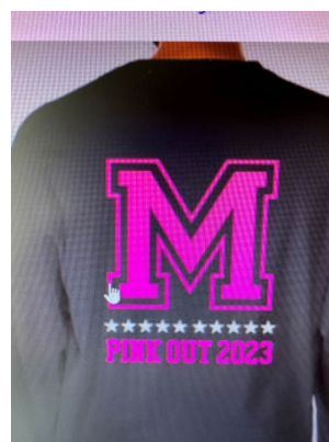
Back of shirt

To order, please contact Montgomery Cheer at jodylyn12@gmail.com or richmondallison@aol.com . Please include your name, size, long or short sleeve, email, and phone number.